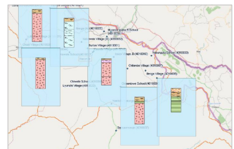
GeODin Professional: map with mini borehole profiles