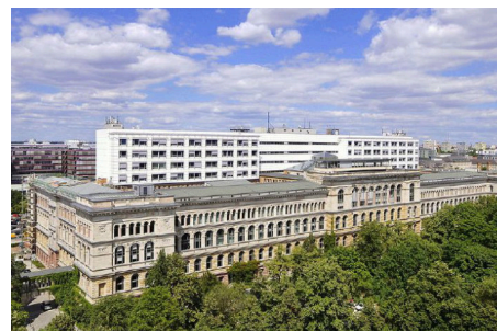
Technical University Berlin

The GeoDin licences are not time limited, but must be activated every twelve months. Activation is dependent upon Fugro receiving information on scientific papers, research projects or teaching carried out with GeoDin (minimum two A4 pages) detailing how GeoDin software is used and how GeoDin has been integrated in your course (e. g. lecture, seminar details). We also would like creative layouts or graphics in a GeoDin format (GGF or GLO), PNG or PDF. When not otherwise agreed in writing prior to activating GeoDin licences, the information supplied will be used on our website info.geodin.com or geodin.com .