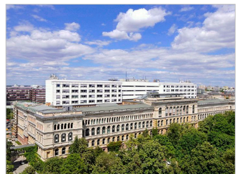
Technical University Berlin

The GeODin licences are not time limited, but must be activated every twelve months. Activation is dependant upon Fugro Germany receiving information on scientific papers, research projects or teaching carried out with GeODin (minimum two A4 pages) detailing how GeODin software is used and how GeODin has been integrated in your course (e.g. lecture, seminar details). We also would like creative layouts or graphics in a GeODin format (ggf or glo), PNG or PDF. When not otherwise agreed in writing prior to activating GeODin licences, the information supplied will be used on our website www.geodin.com .